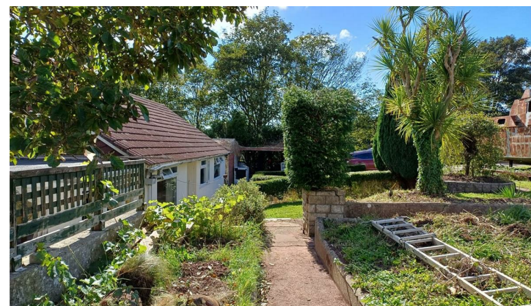
Waterway Located Below Thalassa

This floorplan is only for illustrative purposes and is not to scale. Measurements of rooms, doors, windows, and any items are approximate and no responsibility is taken for any error, omission or mis-statement. Icons of items such as bathroom suites are representations only and may not look like the real items. Made with Made Snappy 360.